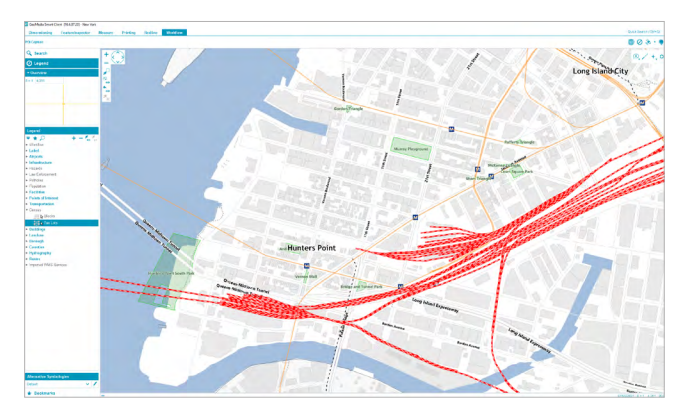
Efficient map reading hinges upon unique and clear styles. GeoMedia Smart Client supports display and printing of complex and high quality cartographic maps based on the OGC standard Symbology Encoding (SE).