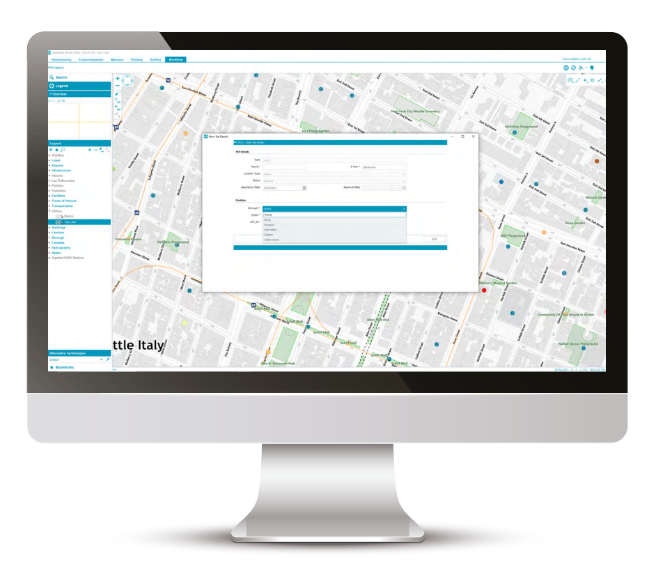
\label{eq:create} Create\ familiar,\ practical\ workflows\ in\ GeoMedia\ Smart\ Client.\ Create\ recognisable\ forms,\ applying\ your\ company\ look\ and\ feel.