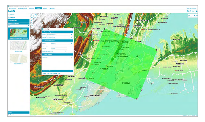
GeoMedia Smart Client provides powerful client-side large scale printing, including rotated views, legend definitions and predefined symbology.