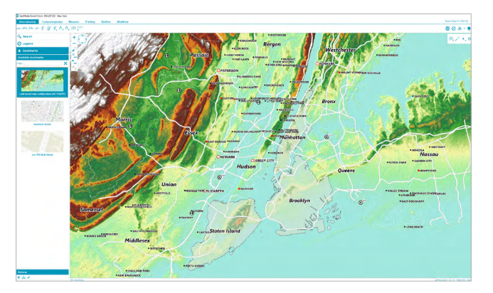
GeoMedia Smart Client displays bookmarks with thumbnails, making it very easy to choose the right map content and spatial area.

For those customers that want to define their own workflows or modify existing ones, this tier of GeoMedia Smart Client includes Workflow Manager – Editor. This enables an organisation to develop its own workflows or revise the structure, process and forms of current ones. Furthermore, organizations can extend insightful decision making to more people by delivering simple maps configured directly from GeoMedia Smart Client to the browser and public-facing websites.